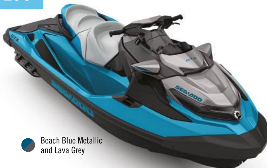
Beach Blue Metallic and Lava Grey