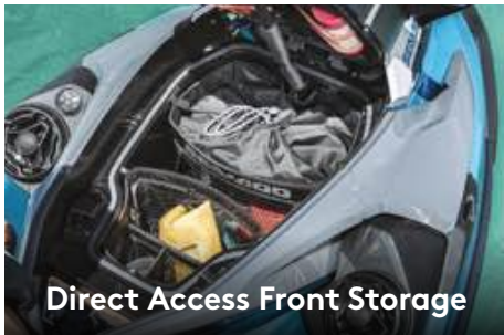
Direct Access Front Storage

Large front storage area that's easily accessible from a seated position. 1