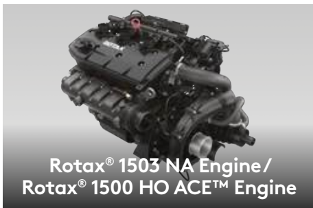
Rotax® 1503 NA Engine / Rotax® 1500 HO ACE™ Engine

An industry-first manufacturer-installed, truly waterproof, Bluetooth ‡ audio system. 2 Standard feature on GTX 230. (Accessory for GTX 155)