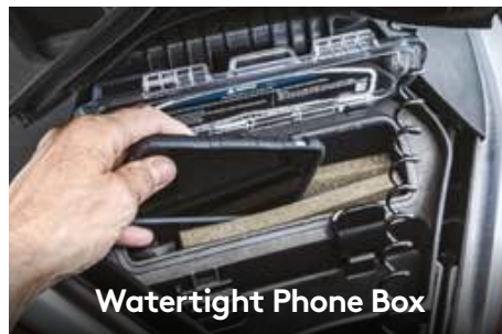
Watertight Phone Box

The Rotax® 1503 NA offers instant acceleration for instant fun while the 1500 HO ACE™ features a powerful supercharger and is equipped with Advanced Combustion Efficiency (ACE) technology.