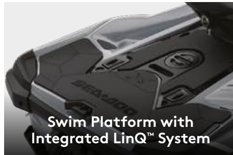
Swim Platform with Integrated LinQ™ System

Large front storage area that's easily accessible from a seated position. 1